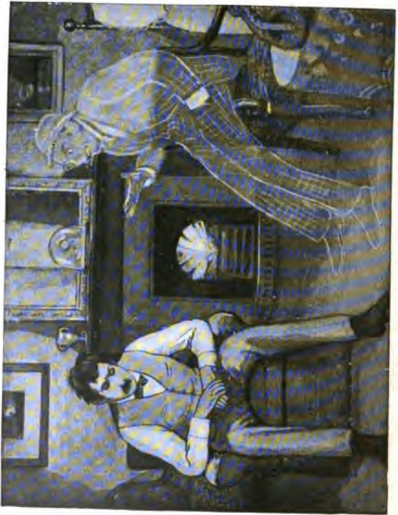
“ ‘ I SHALL KEEP SHOVING YOU FOR EXACTLY ONE YEAR ’ ”